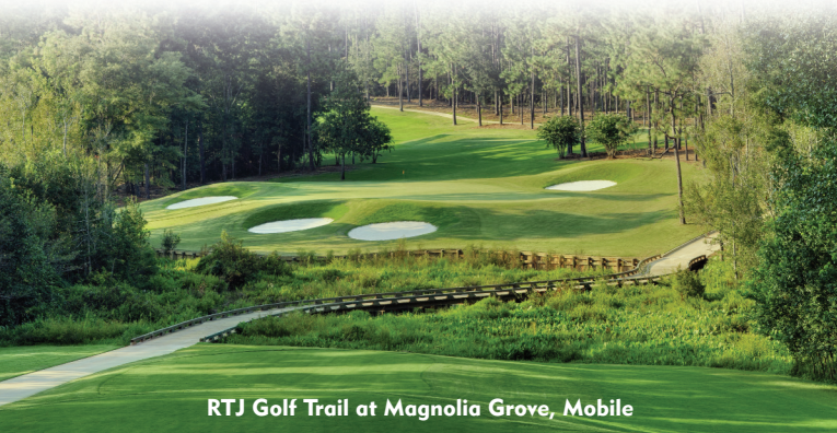
RTJ Golf Trail at Magnolia Grove, Mobile

Golf Groups, Golf Tournaments & Corporate Golf Outings 1-877-476-7034 ♦ www.SouthernGolfTours.com