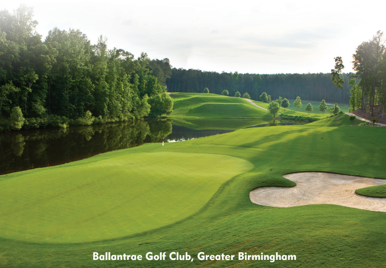
Ballantrae Golf Club, Greater Birmingham