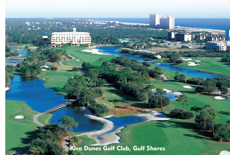
Kiva Dunes Golf Club, Gulf Shores