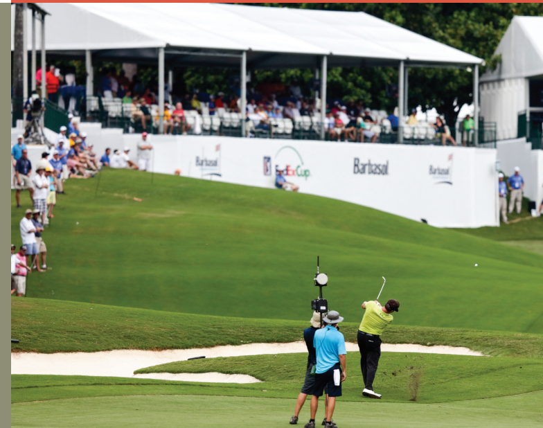
RTJ Golf Trail at Grand National, Auburn-Opelika, Home of the PGA TOUR's Barbasol Championship

*Private courses can be played with member escort. Course Type: PU = Public, P = Private, R = Resort